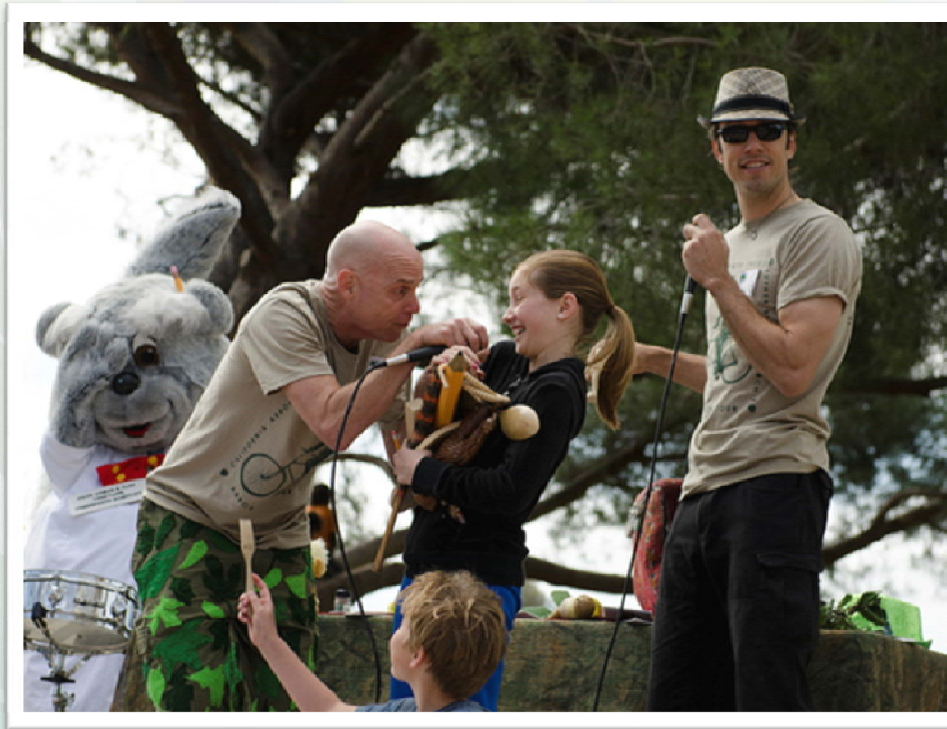
TreeCircus in action on the 2012 California Arbor Day Tour